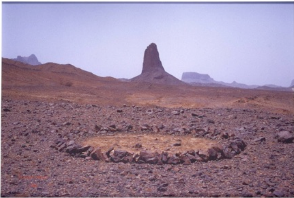
Richard Long, Sahara Circle , 1988