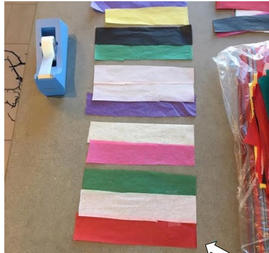
Almost the Italian Flag

When laying out your design, keep in mind the elements of design. Play with different color variations and different shapes until you are happy with your composition. I used a piece of white paper to create a sturdier base for my thinner strips.